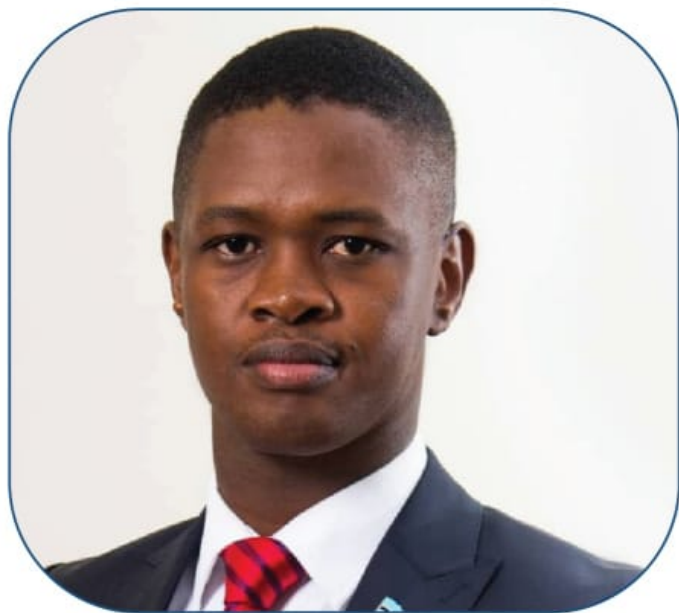
MESSAGE BY THE HONOURABLE MINISTER OF YOUTH, GENDER, SPORT AND CULTURE, MR. TUMISO RAKGARE ON THE OCCASION OF THE 42 ND BOTSWANA SPORT AWARDS, BA ISAGO UNIVERSITY CONVENTION CENTRE, 12TH AUGUST 2023